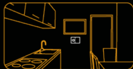
In your kitchen...