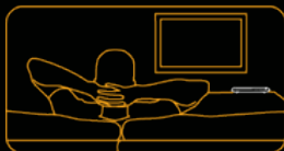
In your living room...