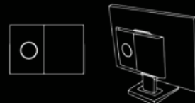
Wall mount or LCD mount

ZOTAC ZBOX can also be mounted using the bundled VESA mount.